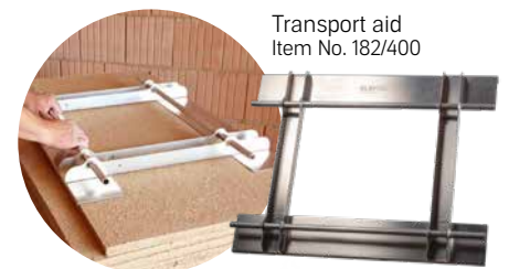
Transport aid Item No. 182/400

Drywall board made of clay for cladding of wood and metal post structures of inner walls, facing shells, ceiling and roof surfaces. The clay building board brings lots of clay into the house, with all the positive effects for the indoor climate, especially in thermal terms. It must be cut with the hand-held circular saw. The Clayboard D 22 provides the walls with a wide drywall substructure grid of 625 mm. As supplement to this product sheet the ClayTec Guidelines for ecological drywalls in system apply.